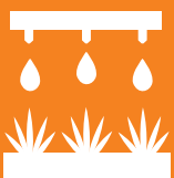
EFFICIENT WATER MANAGEMENT