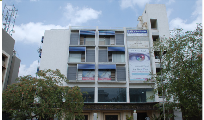
GALA BUSINESS CENTRE 1 & 2 ▶ CG Road & Navrangpura, Ahmedabad