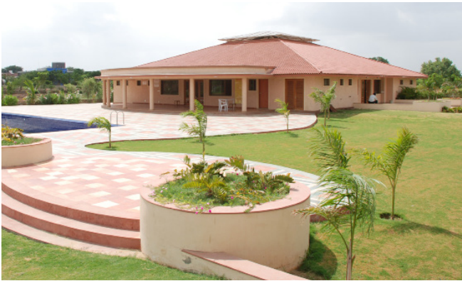
◀ BASANT BAHAR 1, 2, 3, 4, 5 & 6 Bopal, Ahmedabad