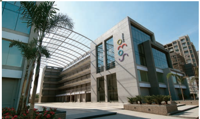
SoBo CENTER ▶ SoBo (South Bopal), Ahmedabad