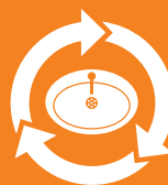
GREY WATER RECYCLING