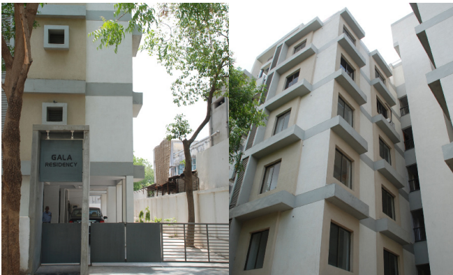
◀ GALA RESIDENCY CG Road, Ahmedabad