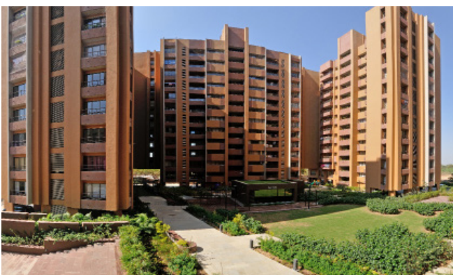
◀ GALA GARDENIA SoBo (South Bopal), Ahmedabad