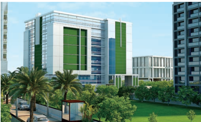
◀ GALA IMPECCA Andheri-Kurla Road, Mumbai