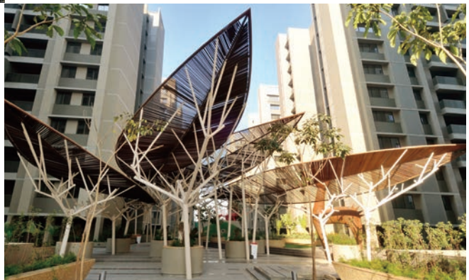
GALA HAVEN ▶ Vaishnodevi Temple