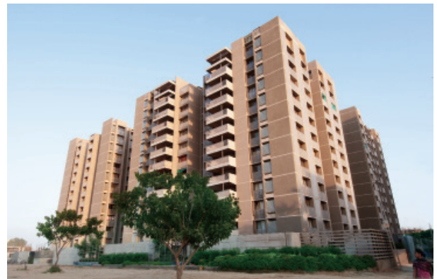
GALA SWING ▶ SoBo (South Bopal), Ahmedabad