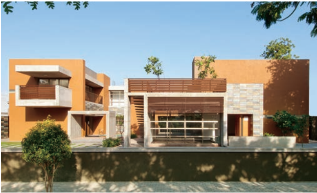
◀ GALA VILLA LOTUS Gokuldham