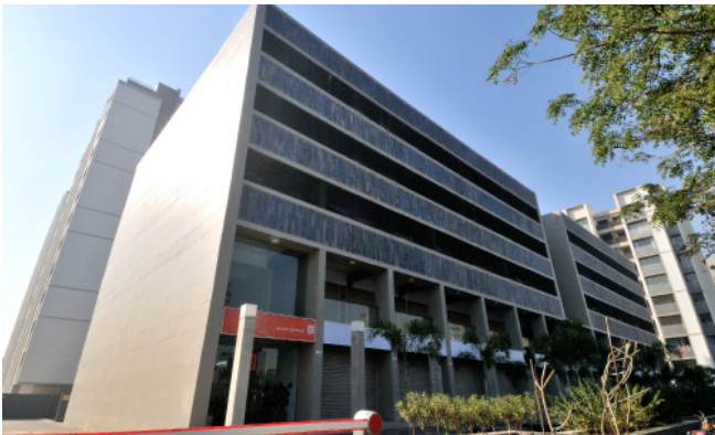
◀ GALA MART SoBo (South Bopal), Ahmedabad