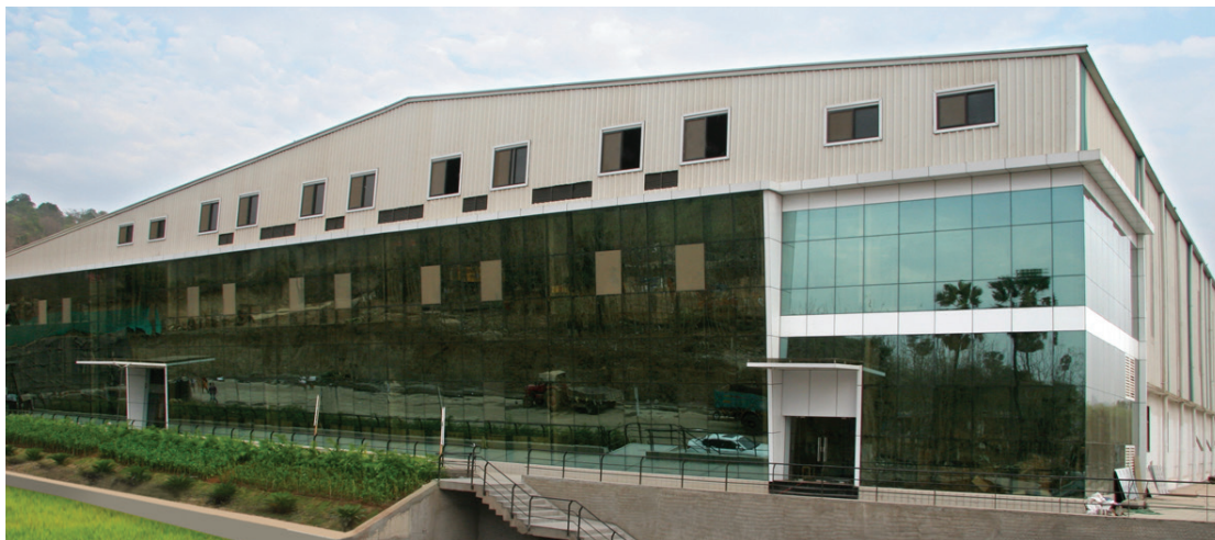
NAVNEET FACTORY AT KHANIWADE