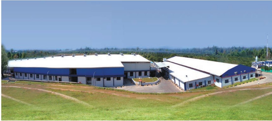
NAVNEET FACTORY AT SILVASSA