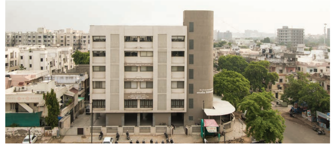
KUTCHI BHAVAN IN AHMEDABAD