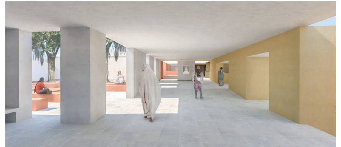
VIRAYATAN IN PALITANA