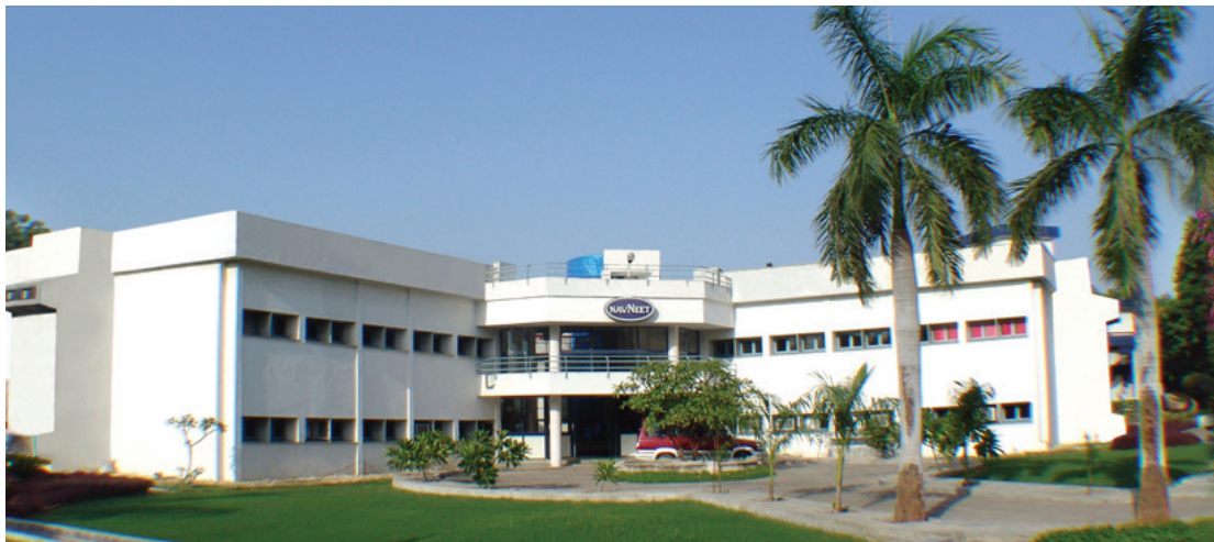
NAVNEET FACTORY AT DANTALI