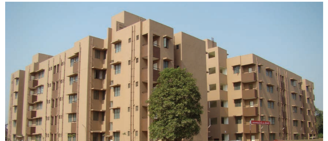
SLUM REHABILITATION IN AHMEDABAD

Over 8 million sq. ft. of real estate developed across Ahmedabad and Mumbai